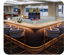
Mexico City Airport Wine Corner MEXICO