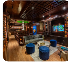
Mexico City Wine Bar MEXICO