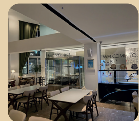
Eur 17 SOUTH KOREA