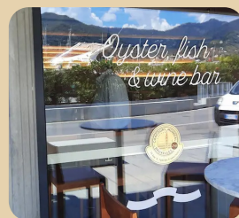
Bistrot Pedol Oyster and Fish Bar ITALY