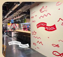
Bistrot Pedol al Mercato Centrale Bolzano - WalthersPark ITALY