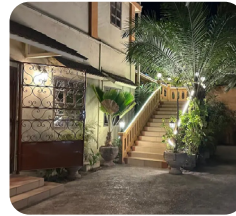
Les Trois Mousquetaires BENIN