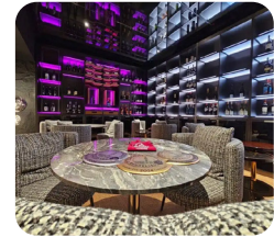
CMB Wine & Spirits Experience Seoul SOUTH KOREA